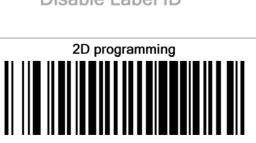
2D programming mode